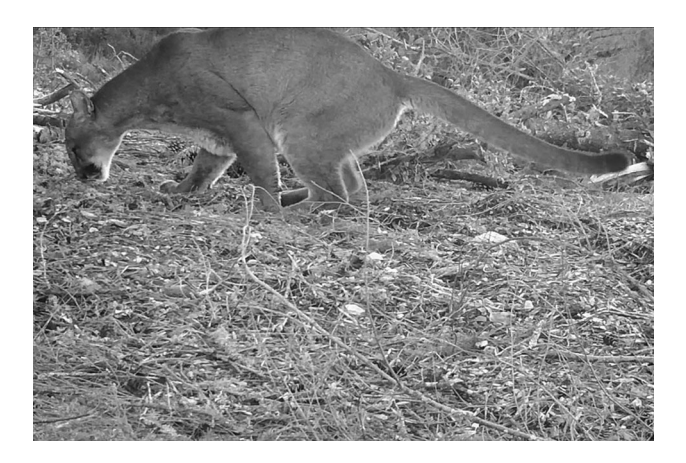
Fig. 1 A video of a puma creating an individual scrape. The area in view of the video is a community scrape % \left( \frac{1}{2} \right) = 0

Over the course of 4 years, we documented gray foxes (Urocyon cinereoargenteus) visiting scent marking areas termed "community scrapes" (Allen et al. 2014). Community scrapes are scent marking areas used by the carnivore guild (Allen et al. 2015a), including pumas (Puma concolor), who use the area for territorial marking and mate selection (Allen et al. 2014, 2015a, 2016). Community scrapes are defined as the broader areas across which scent marking occurs, as opposed to the "individual scrape" created by an individual puma during a scent marking event (Allen et al. (Fig. 1, http://www.momo-p.com/showdetail-e. 2014) php?movieid=momo160812pc01a). The gray foxes we observed frequently used olfactory investigation and then left urine scent marks at these areas. Less frequently gray foxes exhibited cheek rubbing behavior, where they rubbed their cheek, jaw, and neck on puma individual scrapes or other nearby objects (Fig. 2, http://www.momo-p.com/ showdetail-e.php?movieid=momo160812uc01a). The use of puma community scrapes for scent marking, and particularly the cheek rubbing behavior, by gray foxes suggests some aspect of interspecific scent marking was occurring. We could not find any reference in the literature to interspecific communication through cheek rubbing; thus we examined gray fox behavior of cheek rubbing on puma