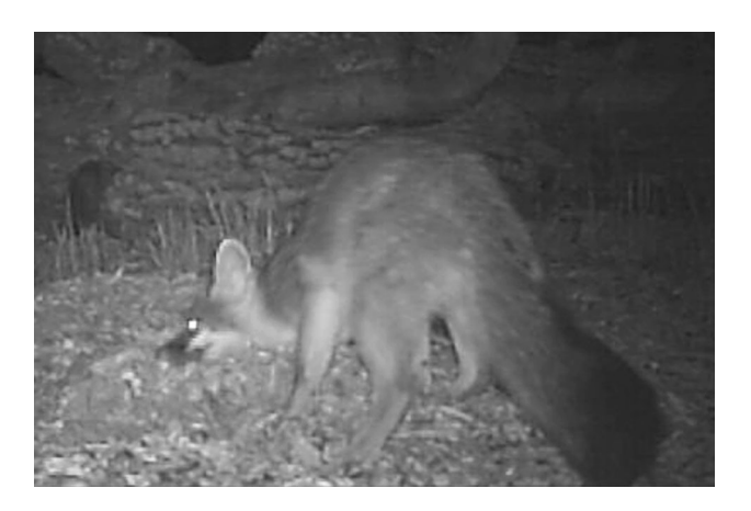
Fig. 2 A video of a gray fox exhibiting cheek rubbing behavior on an individual scrape made by a puma

individual scrapes further to evaluate its functional significance through testing a series of hypotheses.