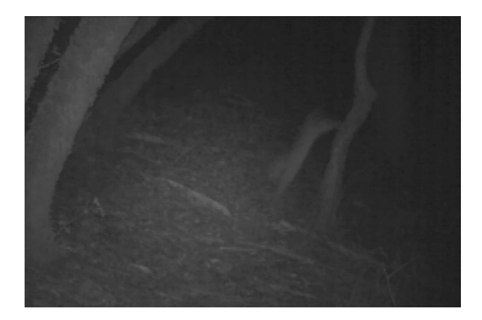
Fig. 6 A video of a gray fox using its tree climbing ability to escape predation by a bobcat

Cascading patterns in the abundance of carnivores, particularly among canines, are known to occur (e.g., Levi and Wilmers 2012). Wang et al. (2015) found a site-specific cascading pattern in the activity patterns of pumas, coyotes and gray foxes, while Allen et al. (2015b) found a cascading pattern in the feeding of carnivores at puma kills. We found a similar cascading pattern in the relative abundance of carnivores at puma community scrapes. Cheek rubbing may be a behavioral response used by gray foxes to deter or escape predation from coyotes and bobcats, as smelling like a large carnivore may deter predation events by meso carnivores long enough for the gray fox to escape (e.g., Garvey et al. 2016). This may be a particular advantage for gray foxes, as their main predation avoidance technique is tree climbing (Fritzell and Haroldson 1982) (Fig. 6, http://www.momo-p.com/ showdetail-e.php?movieid=momo160812uc03a), and hesitation by a larger predator may give the gray fox time to escape into a tree. The giving up densities (GUP) of prey increase in response to predator scent (Bytheway et al. 2013), and the same may be true of carnivores avoiding larger carnivores. This behavior is likely to be most beneficial against larger predators that are smell-dominant, such as coyotes, and we found that gray foxes visited community scrapes 38 times