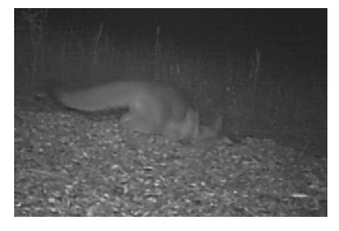
Fig. 3 A video showing a typical sequence of events when cheek rubbing was exhibited. The fox first investigates the puma's individual scrape, follows this by cheek rubbing, and then sometimes urinates on or near the puma individual scrape